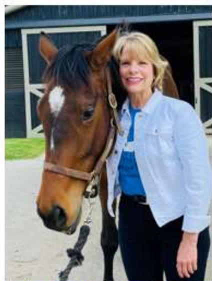
A Letter from the Executive Director