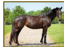
Scat Daddys Girl