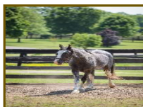
The Sports Finale